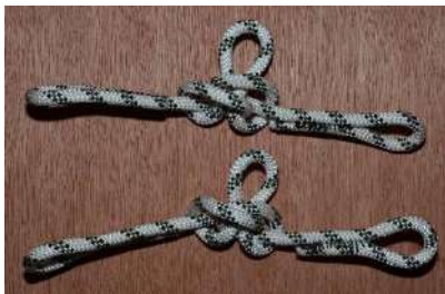
Figure 2 Alpine & Cavers between sewn loops

A batch of test samples were made up from new but washed 9mm SRT rope with either an Alpine Butterfly or a Cavers Butterfly knot tied at each end, see figure 1. The set up was designed to simulate the normal usage of these knots in a traverse situation. Three out of three Alpine Butterfly knot samples broke whilst four out of five Cavers Butterfly knot samples survived. Although the Cavers Butterfly knot samples which survived the tests saw higher peak forces, they also absorbed some 15% more energy without breaking when compared to the energy absorbed in breaking the Alpine Butterfly knot samples. This is in line with the observation by ACT of the Cavers Butterfly knot being a good shock absorbing knot. The breakage point was where the active rope end (between the knots) entered into the knot. In all cases, the loops extended in length.