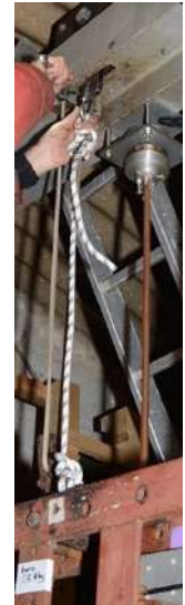
Figure 1 Set Up